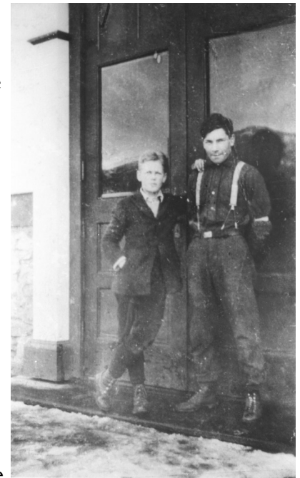
The new Stark School 1916

Photo Project donations please send a check marked "Photos" made out to: Nine Mile Community Center P.O. Box 1061, Frenchtown, MT 59834 or on our website: ninemilecommunitycenter.com .